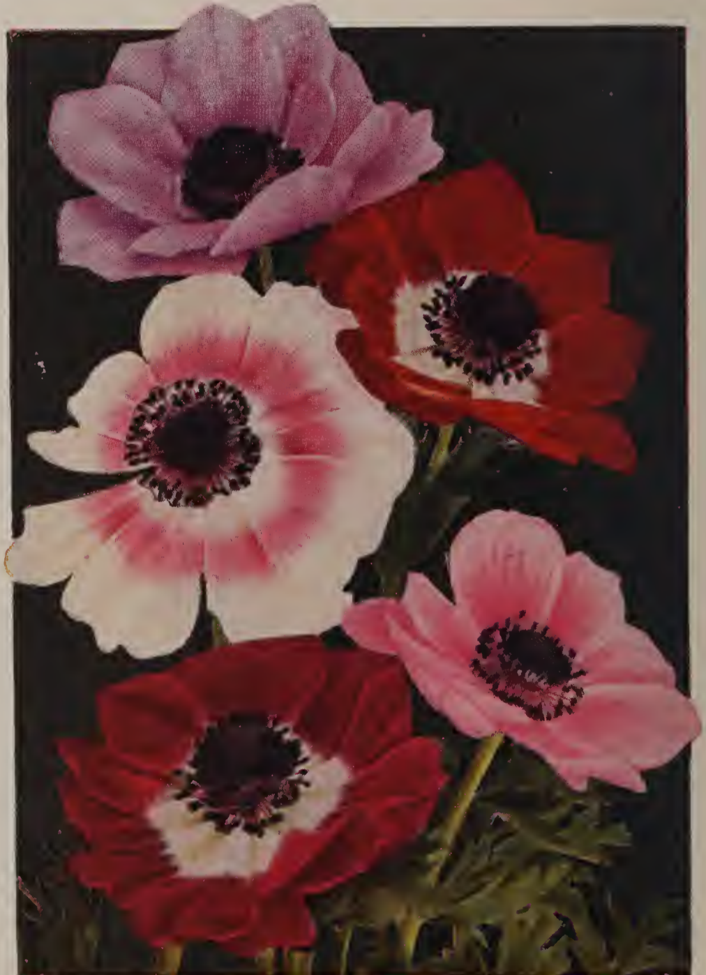
Anemone, St Brigid (Creagh Castle Strain)